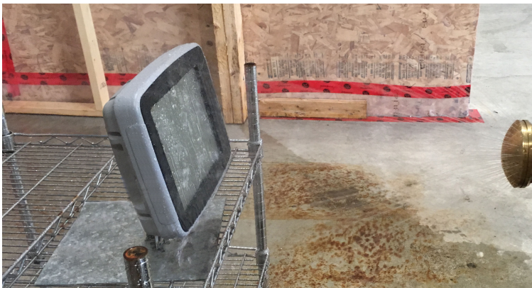
| Water Ingress

Electronics Test Centre offers Mechanical, Environmental and EMC testing for most of the Automotive Standards in one location. We have extensive experience in a wide range of testing as per ISO, IEC and Automotive Manufacturers' standards.